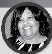
First Lady Pamela Hunter